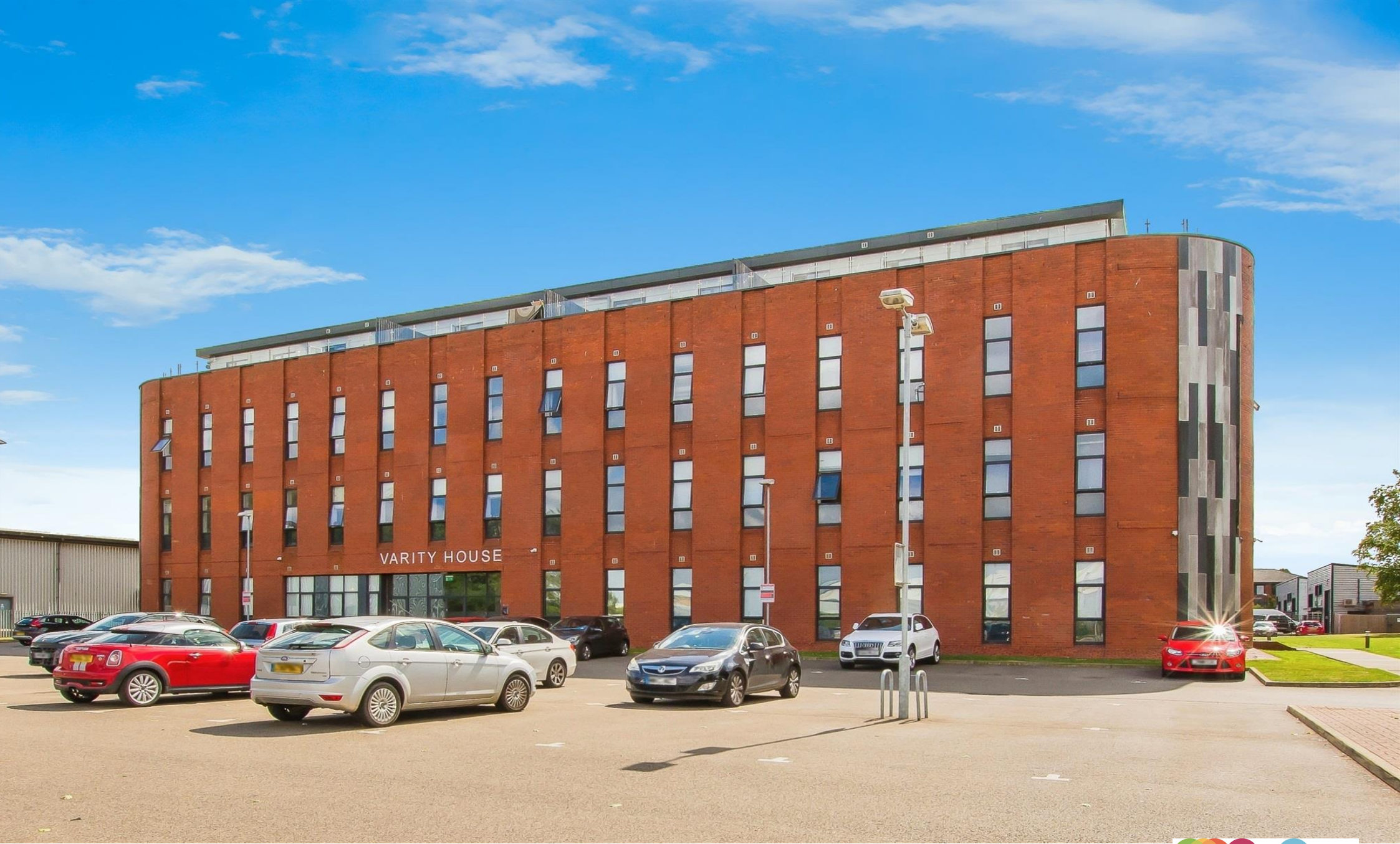
Varsity House, Vicarage Farm Road, Peterborough PE1 5GX