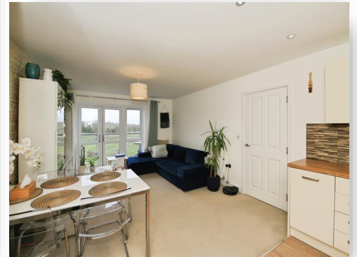
Hartley Avenue, Peterborough PE1 5FT