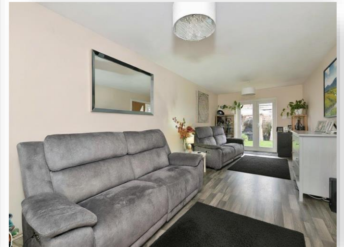
Dandelion Drive, Whittlesey Peterborough PE7 2FH