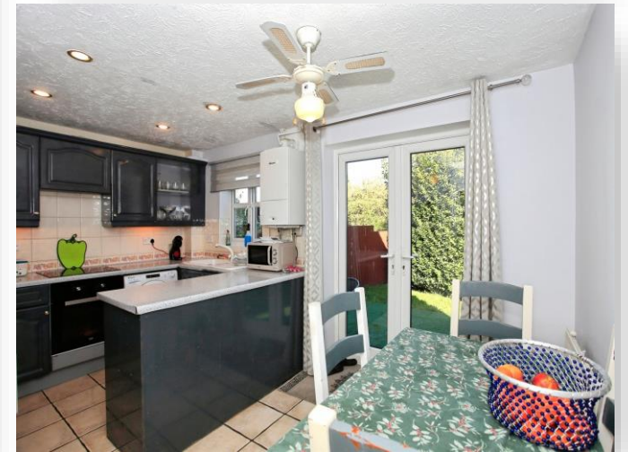
Meadenvale, PETERBOROUGH PE1 5PU