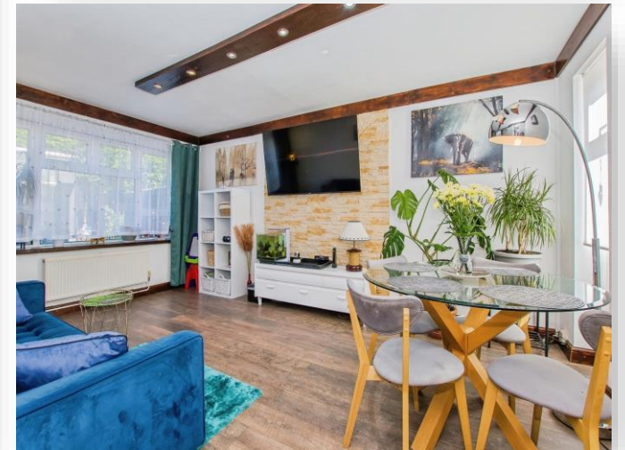
Benland, Bretton Peterborough PE3 8EB