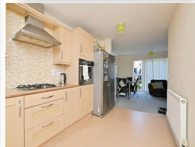
Iris Drive, Peterborough PE2 9SS