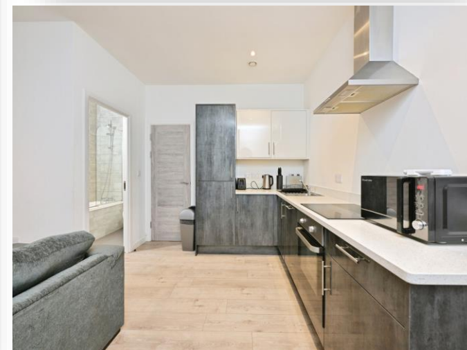
Bayard Apartments Broadway, Peterborough PE1 1RT