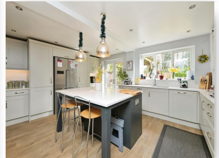
Trienna, Orton Longueville Peterborough PE2 7ZW