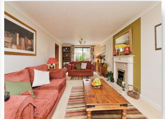
Trienna, Orton Longueville Peterborough PE2 7ZW