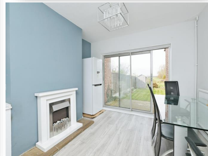
Crowland Road, Eye Peterborough PE6 7TP