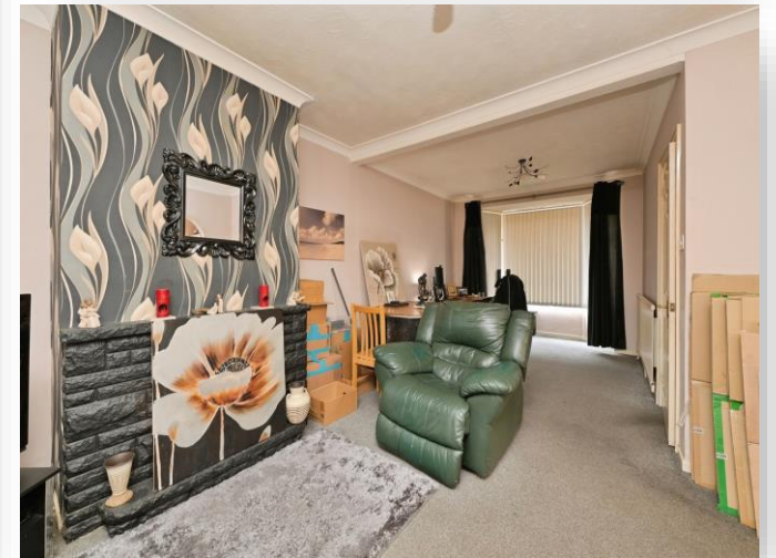
Paston Lane, Peterborough PE4 6HB