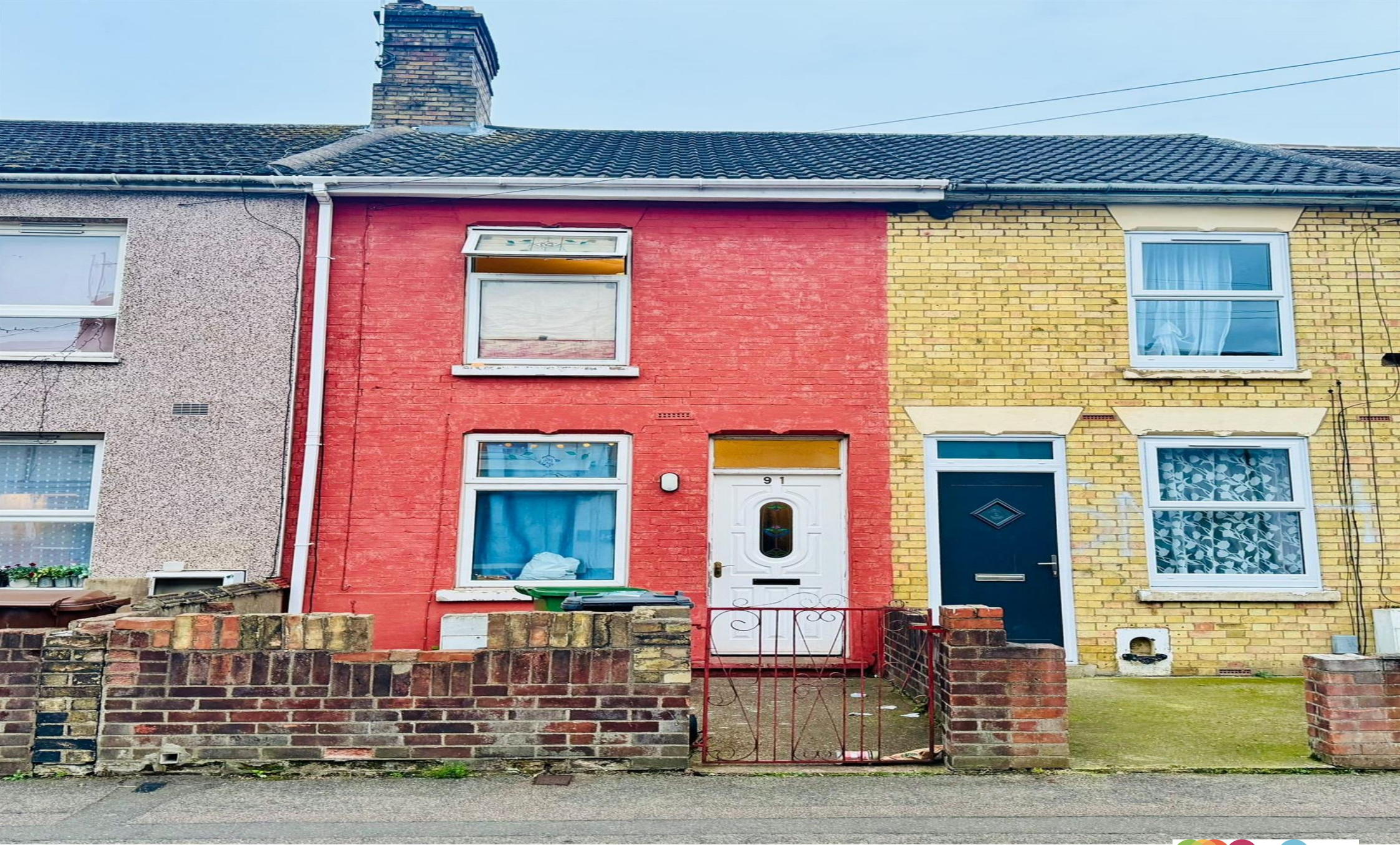
Gladstone Street, Peterborough PE1 2BN