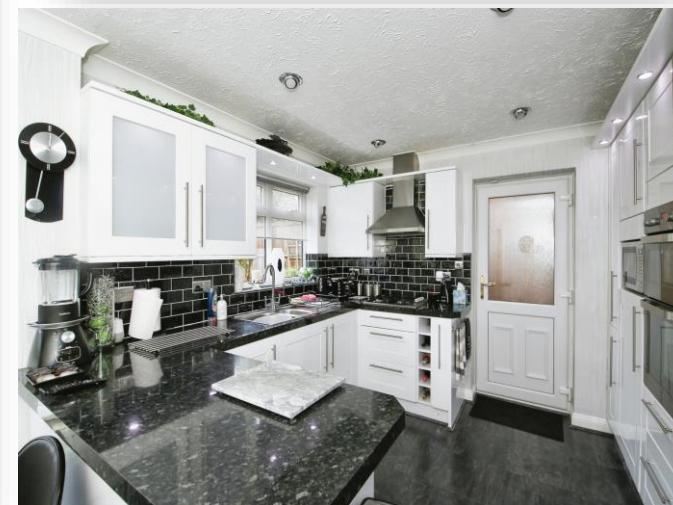
Rosyth Avenue, Orton Southgate Peterborough PE2 6SL