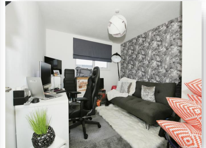
Artindale, Bretton Peterborough PE3 9YL