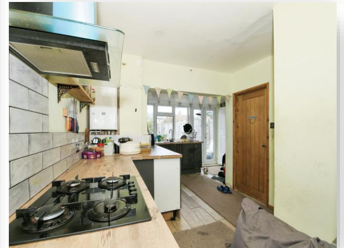
Willesden Avenue, PETERBOROUGH PE4 6EB