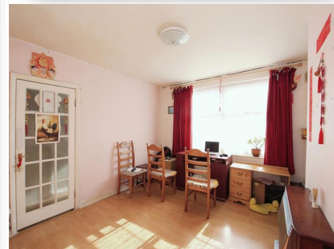
St. James Avenue, PETERBOROUGH PE1 3JR