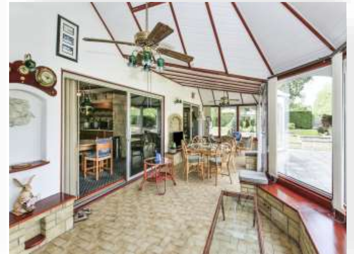
Paston Ridings, Peterborough PE4 7UY