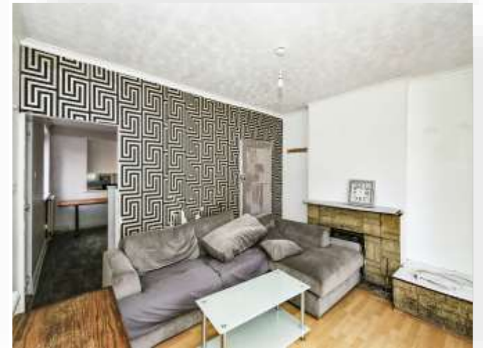
Northfield Road, Peterborough PE1 3QF