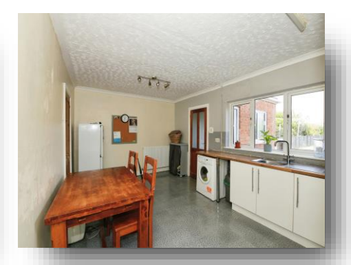
Google Map data @2024