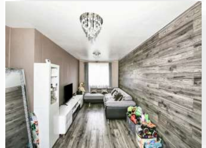
Western Avenue, PETERBOROUGH PE1 4HT