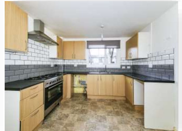
Manton, Bretton Peterborough PE3 9YU