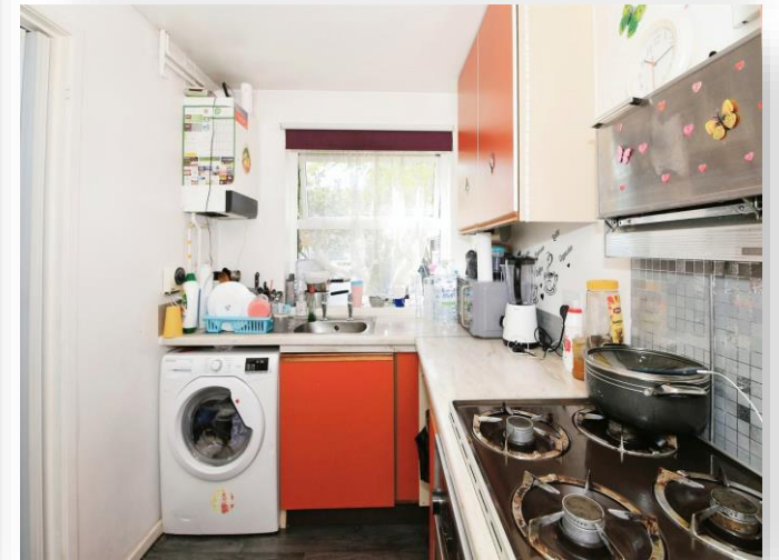
St. Pauls Road, Peterborough PE1 3RN