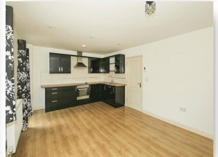
Rowledge Court, Peterborough PE4 6BA