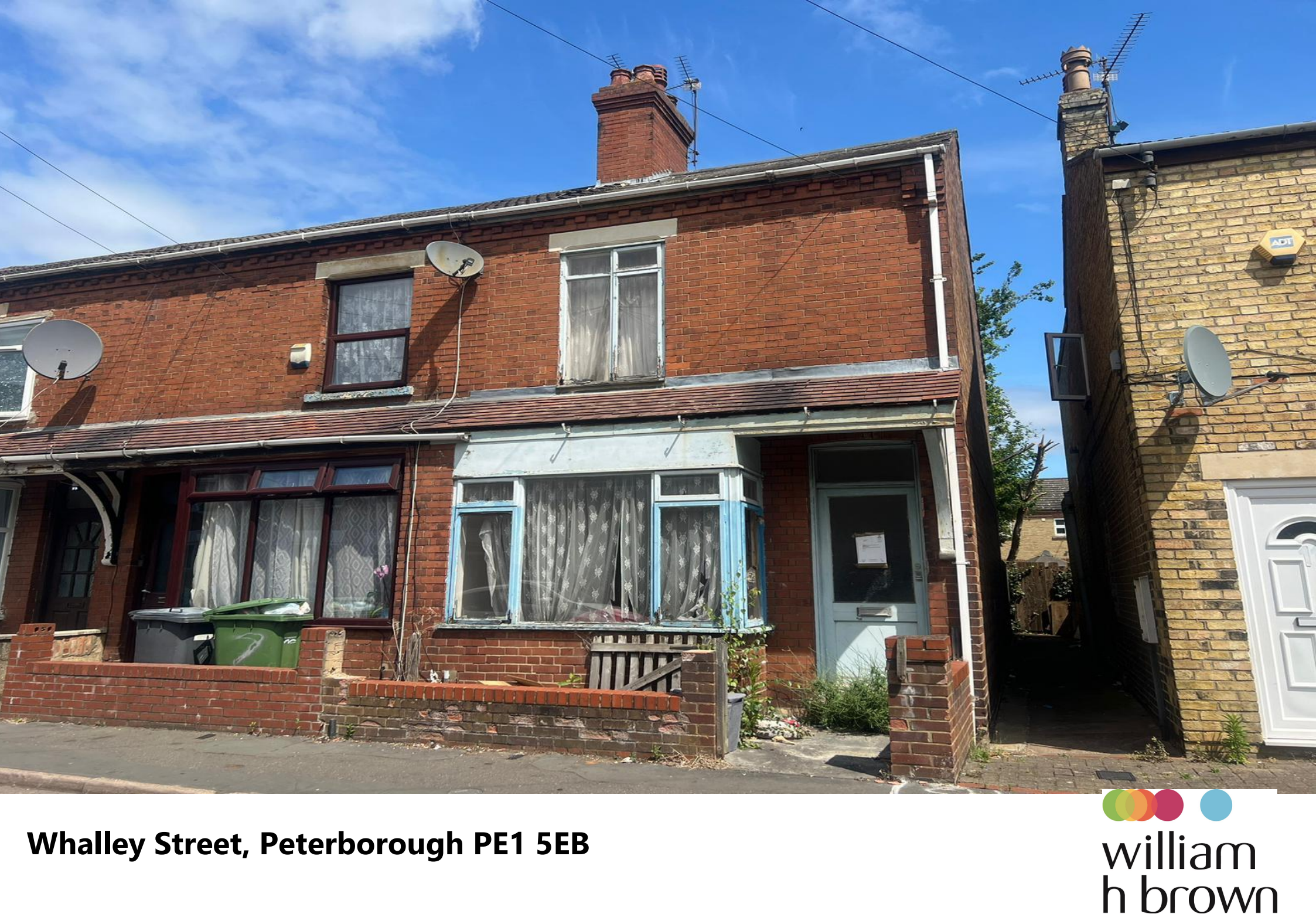
Whalley Street, Peterborough PE1 5EB