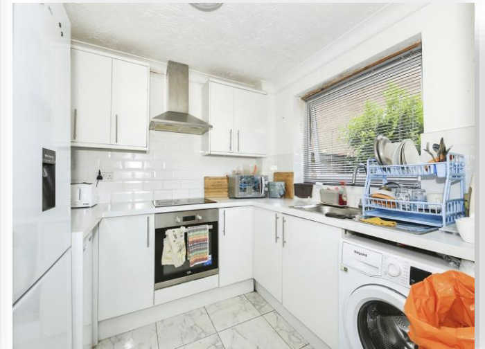
Whitacre, Peterborough PE1 4SU