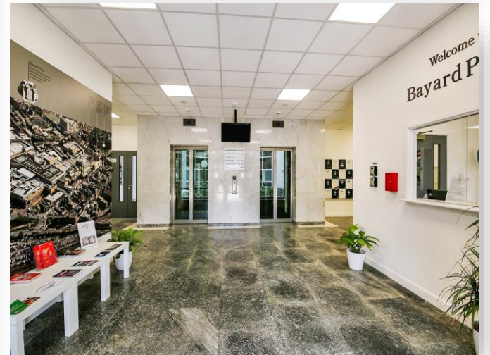
Bayard Apartments Broadway, Peterborough PE1 1RT