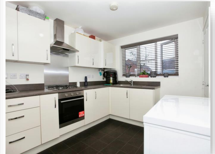
Apricot Close, Peterborough PE1 4FY