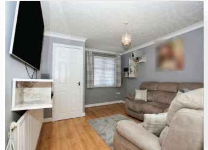
Meadenvale, Peterborough PE1 5PU