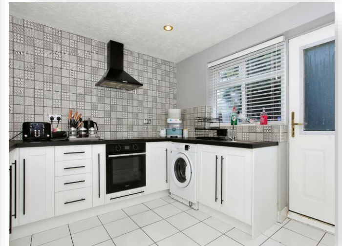
Meadenvale, Peterborough PE1 5PU