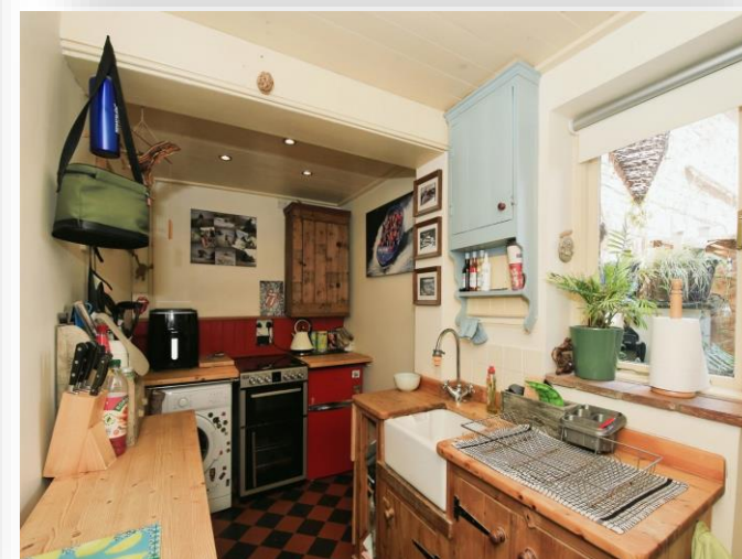
Globe Cottages Whittlesey Road, Thorney Peterborough PE6 0RA