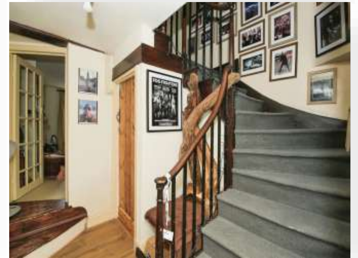
Globe Cottages Whittlesey Road, Thorney Peterborough PE6 0RA