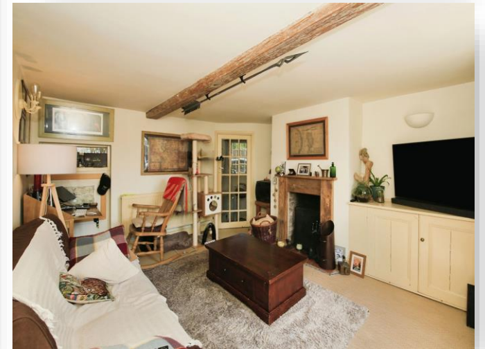
Globe Cottages Whittlesey Road, Thorney Peterborough PE6 0RA