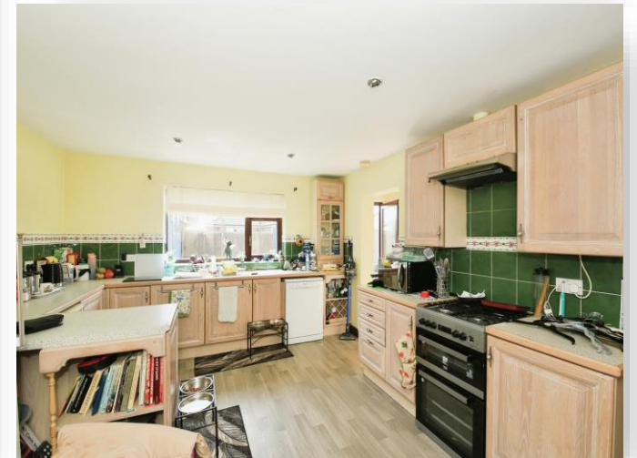
Coates Road, Whittlesey Peterborough PE7 2BA