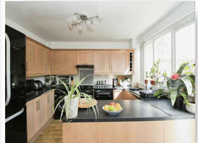
Padholme Road, Peterborough PE1 5EE