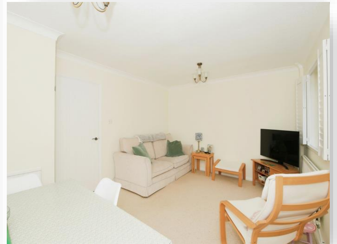
Ferryview, Orton Wistow Peterborough PE2 6XL