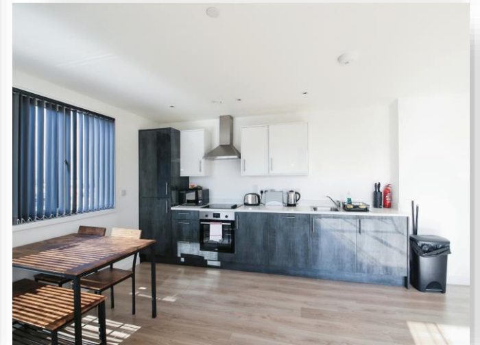
Bayard Apartments Broadway, Peterborough PE1 1RT