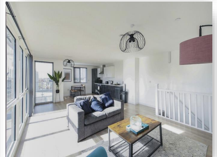
Bayard Apartments Broadway, Peterborough PE1 1RT