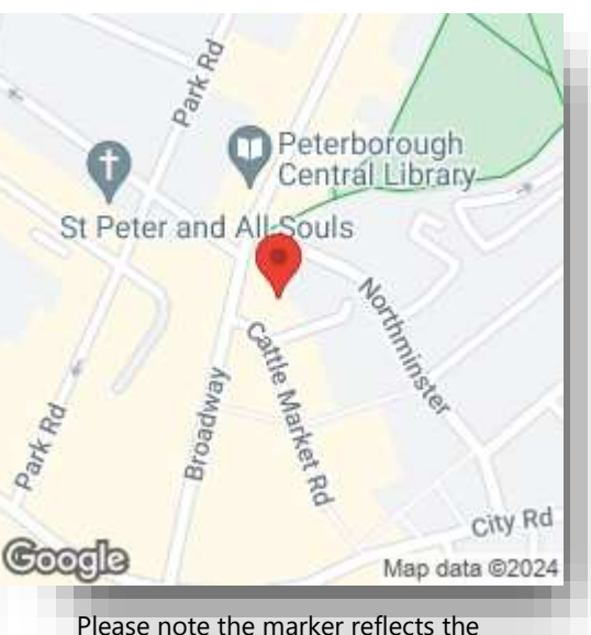
postcode not the actual property