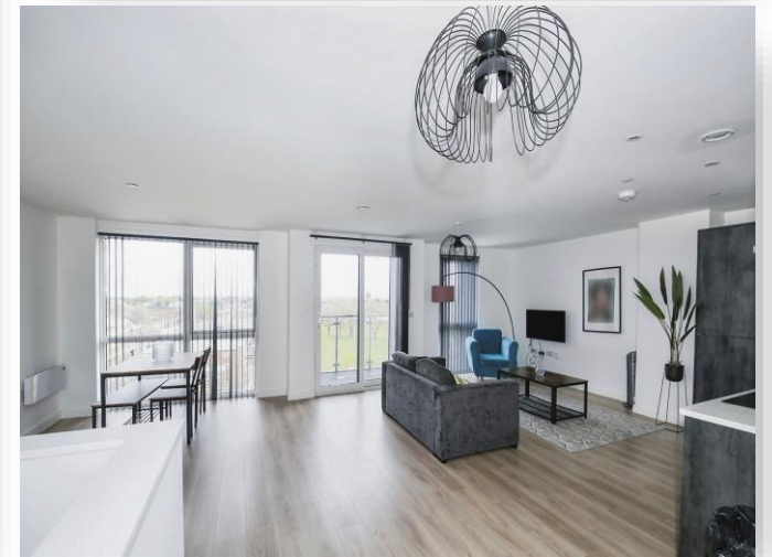
Bayard Plaza Broadway, Peterborough PE1 1RT