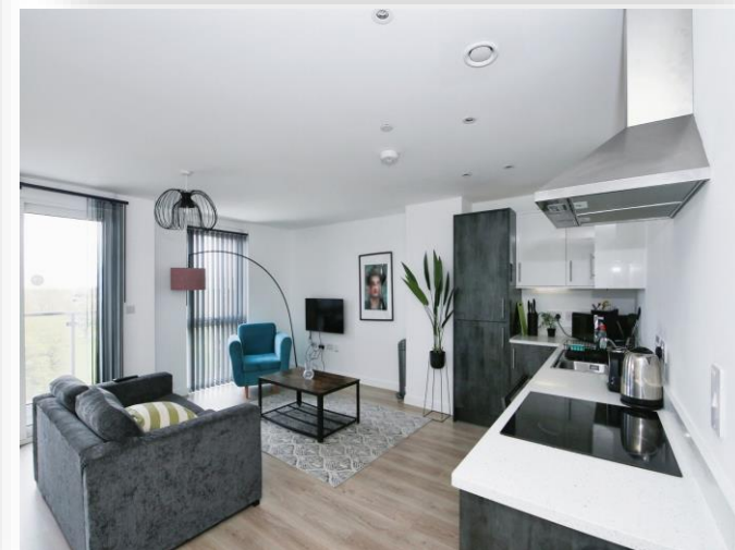
Bayard Plaza Broadway, Peterborough PE1 1RT