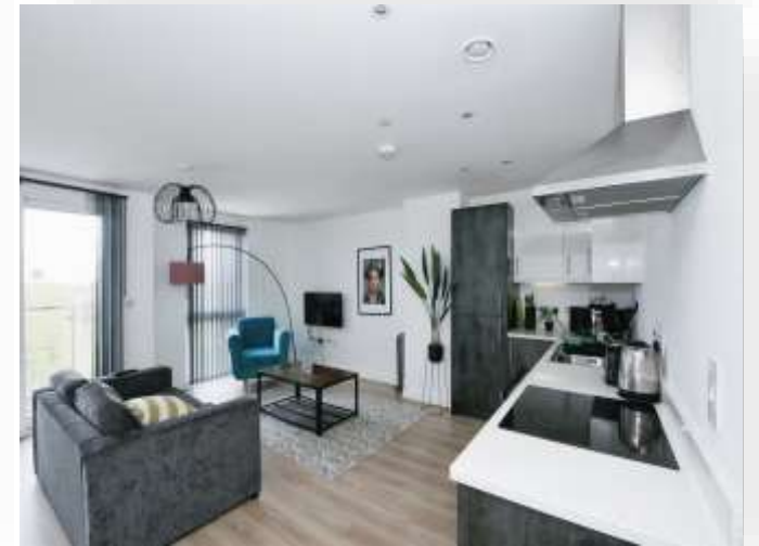
Bayard Plaza Broadway, Peterborough PE1 1RT