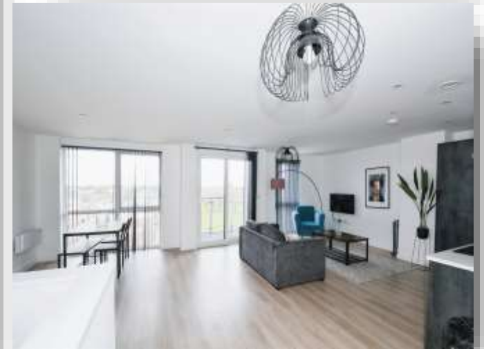
Bayard Plaza Broadway, Peterborough PE1 1RW