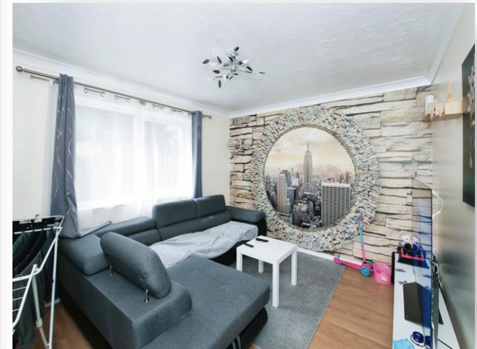
Shortfen, Orton Malborne Peterborough PE2 5NP