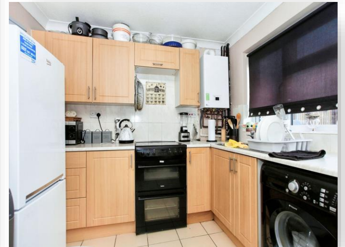
Sellers Grange, Orton Goldhay PETERBOROUGH PE2 5XX