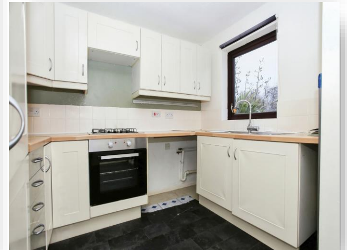
Osprey, Orton Goldhay Peterborough PE2 5FW