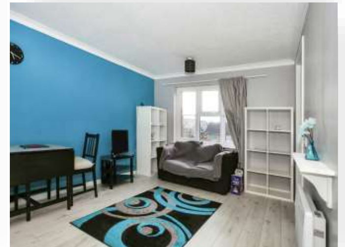
Lincoln Gate, Peterborough PE1 2RE