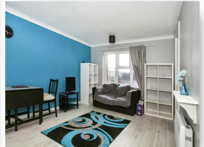
Lincoln Gate, Peterborough PE1 2RE