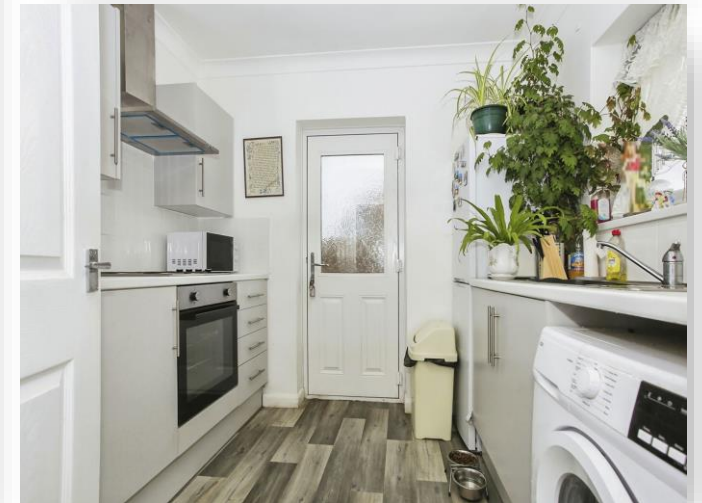
Lawson Avenue, Peterborough PE2 8PN