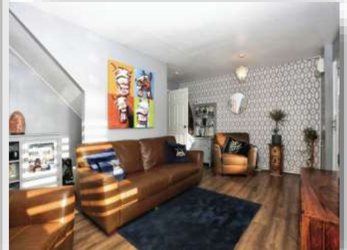
Long Pasture, Peterborough PE4 5AX