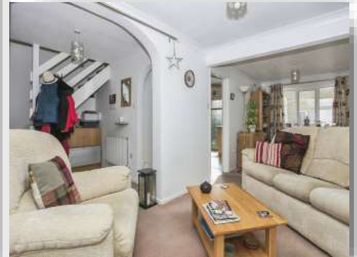
Wingfield, Orton Goldhay Peterborough PE2 5TJ